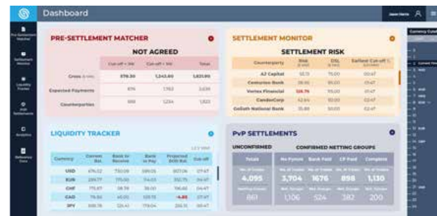
The Baton platform offers a management dashboard and automated alerts which provide real-time updates on key business functions and priorities

None. We use commercial bank money and not central bank money for the settlement process, so it is far easier for us to add new currencies on the platform when required. We built the platform to be truly